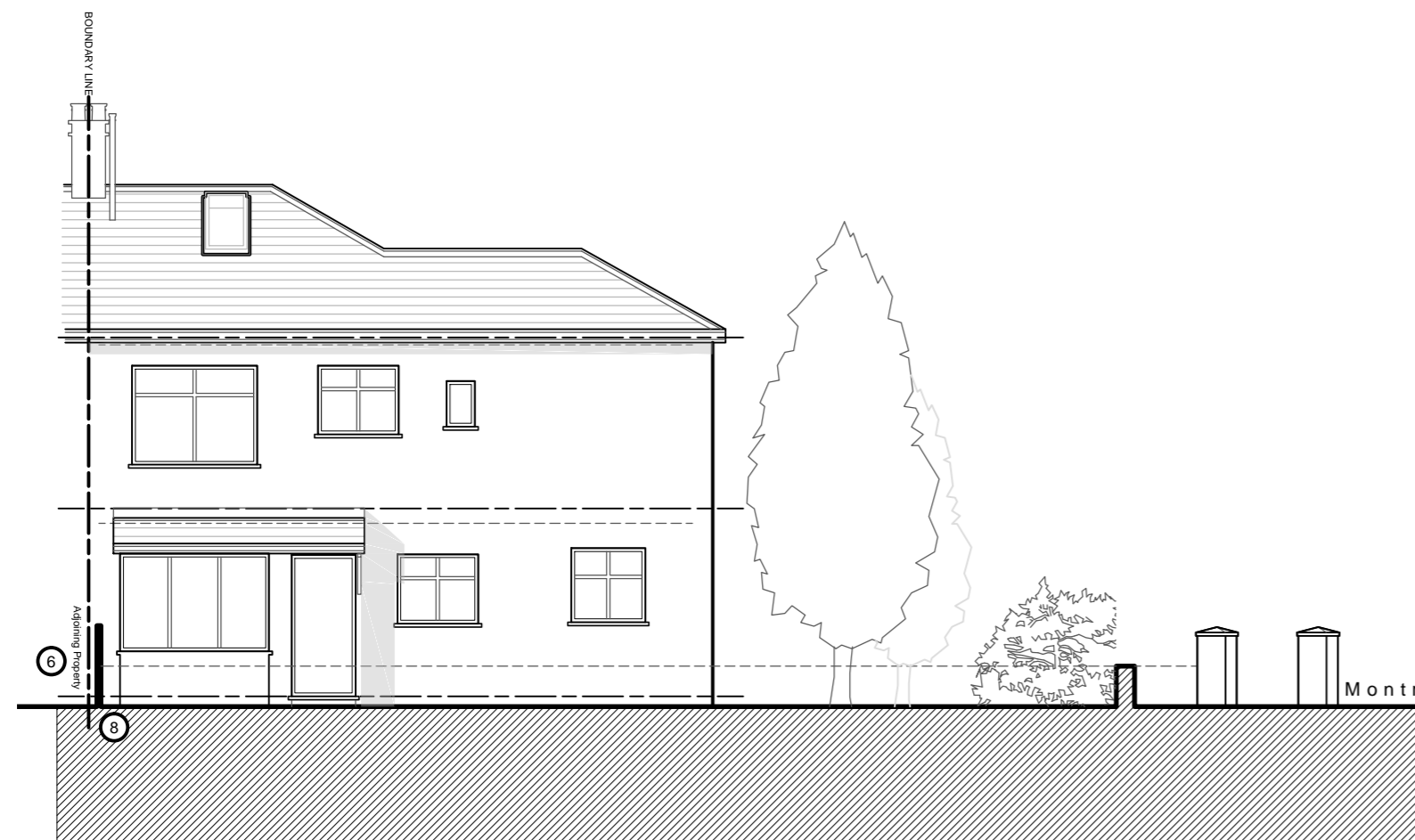
3 Existing Rear Elevation Scale 1:100